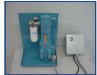
Kidney Loop Filtration