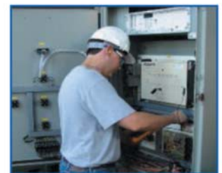
Tuning a Digital Governor

We specialize in ALL Woodward equipment including: