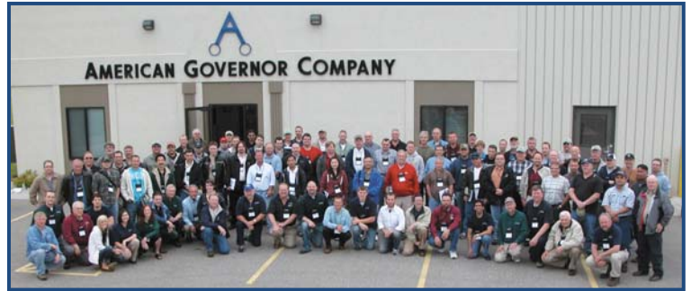
Governor School - Amherst, WI