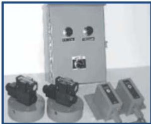
Pump Unloader Kits