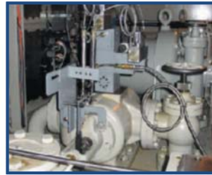
Redundant Proportional Valve Manifold