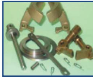
Speed Switch parts