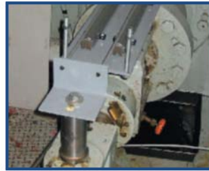
Redundant Gate Position Feedback