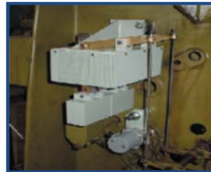
Speed Adjust Transmitter