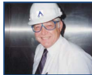
Expert Governor Specialists