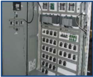
Redundant PLC Controls Cabinet