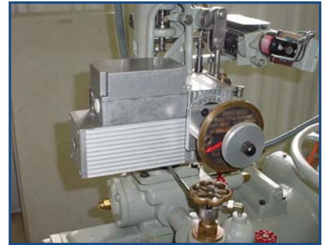
Gate Limit Actuator

American Governor Company offers a complete line of pre-engineered retrofit kits, partial upgrade kits, and digital governor systems: