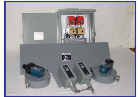
Unloader Pilot Valve Kit