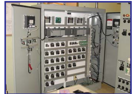
Digital Governor Cabinet

Other Types: Pelton, Cheston, Allis-Chalmers, Voith, Lombard, SM Smith and others