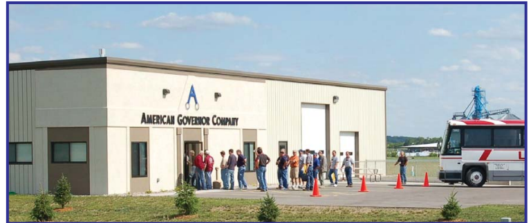
Wisconsin Training and Repair Facility

American Governor has a wide variety of governor assemblies and auxiliary systems that can be sent out on short notice to get your unit running.