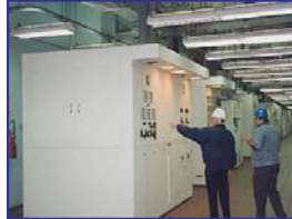
Mechanical Cabinet Actuators