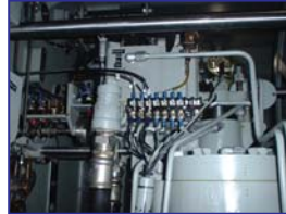
Analog Cabinet Actuators