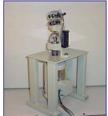
Auxiliary Speed Switch Under Test

American Governor Company offers a complete line of pre-engineered retrofit kits, partial upgrade kits, and digital governor systems: