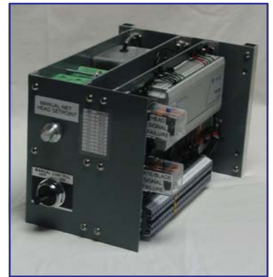
Actual configuration may vary