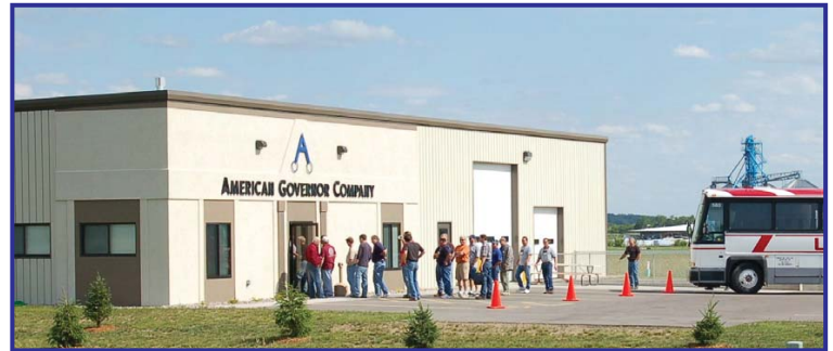
Wisconsin Training and Repair Facility

American Governor has a wide variety of governor assemblies and auxiliary systems that can be sent out on short notice to get your unit running.